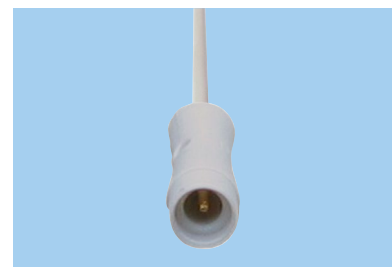
SC = 0.7 mm connector