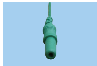
M = 1.5 mm connector